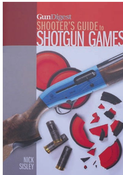
Sisley's new book Shooter's Guide to Shotgun Games includes the techniques discussed in this article and more shotgun shooting instruction.

technique - but way beyond - just keep up this easy practice. It's fun. You can do it all your life. You're handling your favorite shotgun - getting ever more familiar with its handling qualities. It's free! The low 6 and low 7 target stuff isn't free, but it's not that costly. And it's also great fun. 🐾